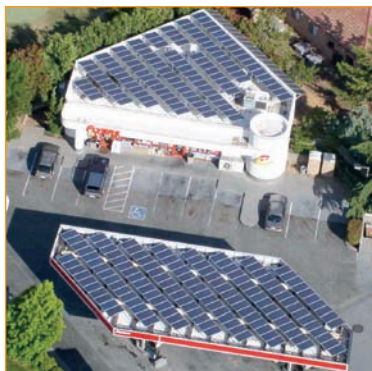
Sharp multi-purpose modules offer outstanding performance for a variety of applications.