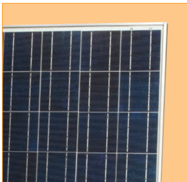
Solder-coated grid results in high fill factor performance under low light conditions.