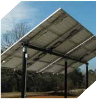
Underside of multi-pole mount