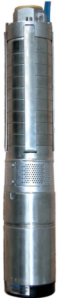
PS150-Centric C-SJ5-8 Controller, Pump and brushless motor