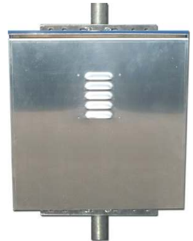
Mounts to 2-3" schedule 40 pole using 2 u-bolts (Bolts not included)