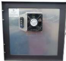
Door fans available in 12V, 24V, and 48V DC/120V AC