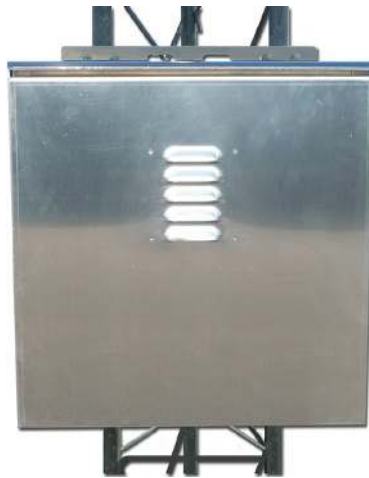
Mounts to ROHN25 tower using 4 u-bolts (Bolts not included)