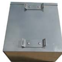
Banding available for unique mounting structures