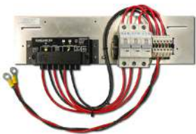
Custom designed assembly sized to meet solar system requirements