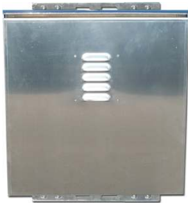
Mounts on wall using 4 lag bolts (Bolts not included)